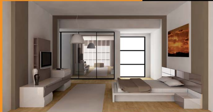
Original photo from a digital camera