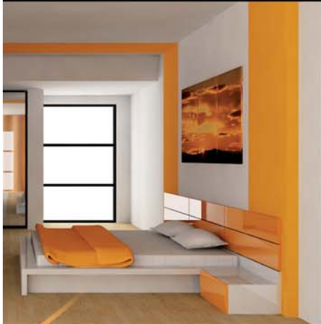
Simulation of selected colour