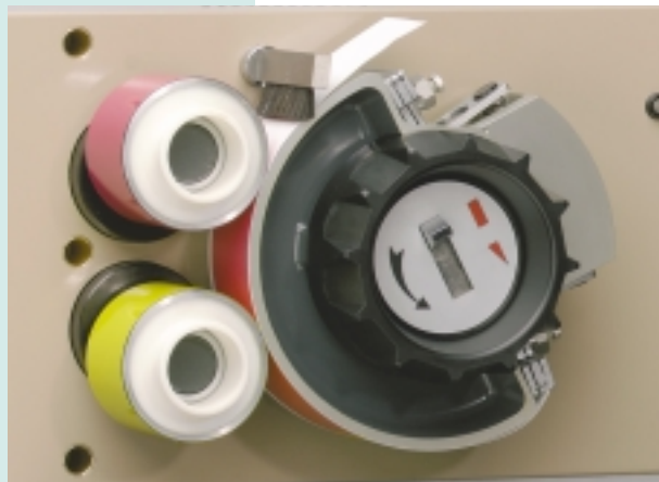
The IGT AIC2-5 suitable for two printing forms