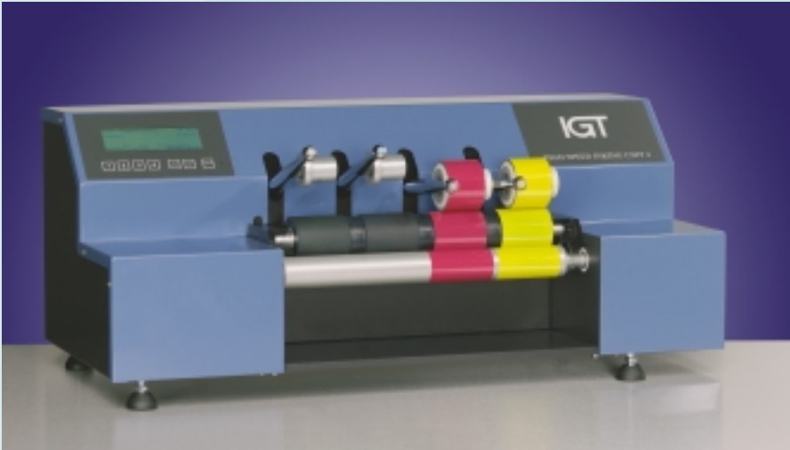
The IGT High Speed Inking Unit 4 for ultra-fast inking