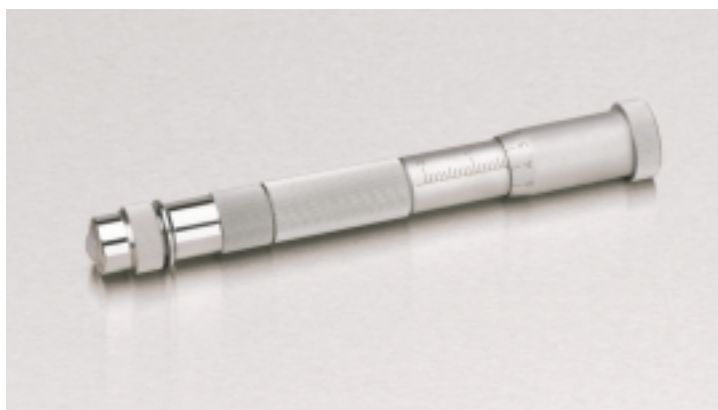
IGT Ink pipette

The use of an IGT ink pipette to apply offset ink to the inking unit is strongly recommended because it increases the accuracy of application of ink and therefore the inking, thereby enhancing the performance of the tests.