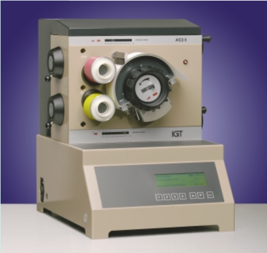
The IGT AIC2-5 suitable for many test purposes