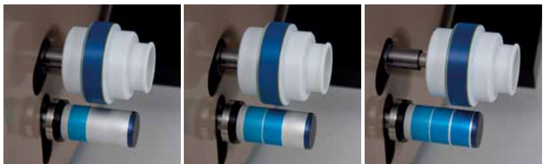
Printing on cans and tubes with CTx3

All C1 testers allow to print on cans with a diameter between 63 and 68 mm. The CTx3 is especially designed to print three strips of 15 mm, besides each other, directly on cans and tubes with a diameter between 16 and 68 mm. This unit is equipped with an easy exchangeable impression cylinder to slide the tin or tube on. Also prints of 35 mm wide can be made on tins and cans. With the CTx3 prints of 35 mm or 3x15 mm and regular prints on flat substrates can be produced as well.