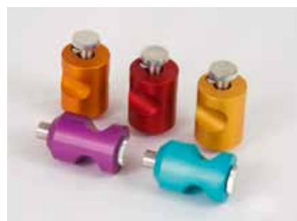
The IGT fixed volume ink pipettes

The standard printing disc is covered with a rubber or a rubber blanket for conventional inks. Discs are available with rubber or a rubber blanket for UV-curing inks. Furthermore, there is a printing disc with an aluminium surface. The weight of the printing discs is less than 160 g, so they can be weighed on most analytical balances. To print halftones there is a wide choice in special discs with halftone photopolymer 40-70 l/cm. On request these ones can also be customized.